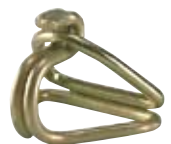
NH33206 1" Light Duty Hook & Keeper Breaking Strength: 1,200 lbs. Working Load Limit: 400 lbs.