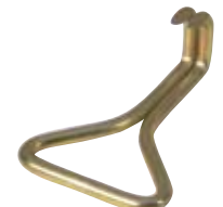
NH34031-7 1" Pallet Hook Breaking Strength: 2,000 lbs. Working Load Limit: 667 lbs.