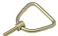
NH31416 2" Strap Stud Breaking Strength: 4,500 lbs. Working Load Limit: 1,500 lbs.