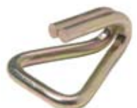
NH34031-8 1" Wire Hook Breaking Strength: 3,000 lbs. Working Load Limit: 1,000 lbs.