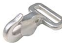
NH31417 1-3/4" Butterfly Snap Hook Breaking Strength: 5,000 lbs. Working Load Limit: 1,667 lbs.