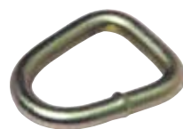
NH34025-50 1" Welded Delta Ring Breaking Strength: 5,000 lbs. Working Load Limit: 1,667 lbs.