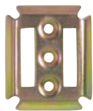
2 position E Track Mounting Plate

Countersunk mounting holes. Overall size: 4-3/8" x 3-3/4"