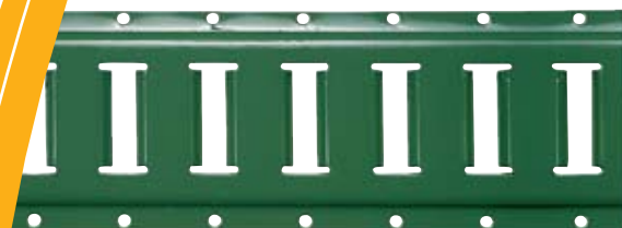
Series E Track Horizontal (iron phosphate primer green)

Material: 12 Gauge high strength steel Weight: 16.6 lbs. Length: 10' Finish: Iron phosphate primer green or Galvanized*