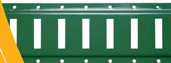
Heavy-Duty Series A Track Horizontal

30 mph/20G Wheelchair crash tested Material: 11 Gauge high strength steel Weight: 21.1 lbs. Length: 10' Color: Iron phosphate primer green