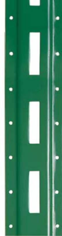
Heavy-Duty Series A Track Vertical (iron phosphate primer green)