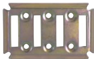
4 position E Track Mounting Plate

Countersunk mounting holes. Overall size: 7/18" x 4-1/2"