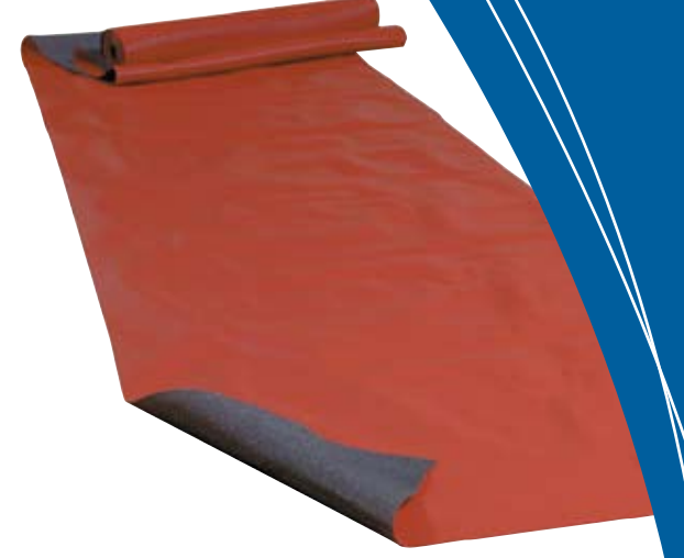
Red Vinyl Floor Runner NH792-15