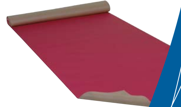
Neoprene Cushioned Floor Runner NH786-15