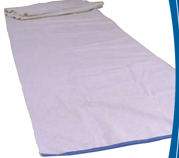
Canvas Floor Runner NH785-10