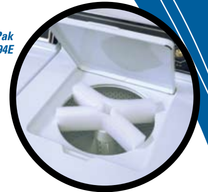
Washer Pak NH794E