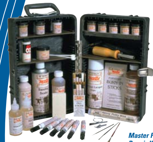
Master Finish Repair Kit NH937A