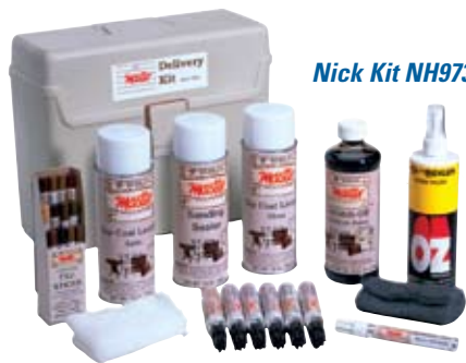
Nick Kit NH937B