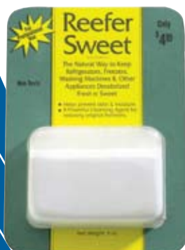
Reefer Sweet NH764