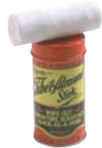
Almond Stick NH935