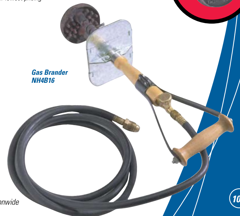
Gas Brander NH4B16

NH80EBD Branding Die (minimum) Call for lowest pricing